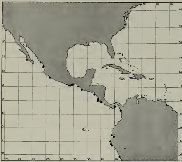
Fig. 2. Geographic distribution of Symphurus callopterus based on available study material. Dots indicating collection localities may represent more than one occurrence and more than a single specimen from each locality.

specimens, obscuring blotches to naked eye (but still perceptible under magnification).